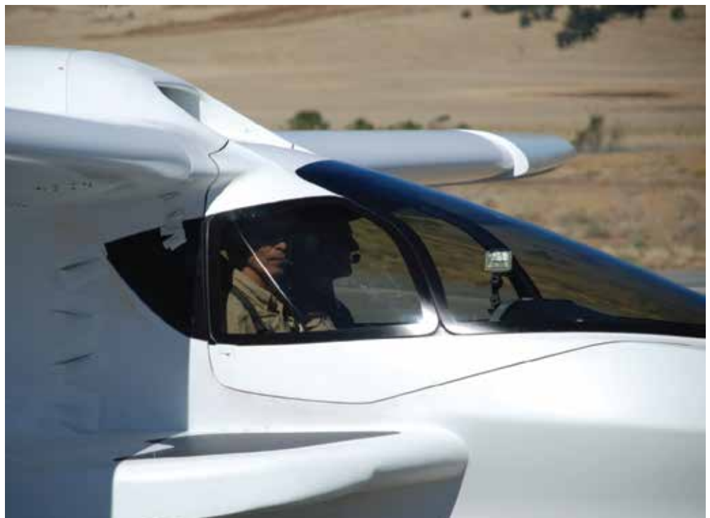
This photo of the completed and installed spin-resistant wing clearly shows the cuff on the outboard panel of the wing.

http://www.aopa.org/asf/publications/10nall.pdf http://www.airspacemag.com/flight-today/cit-bourque.html?c=y&page=5 http://www.aopa.org/asf/ntsb/stall_spin.html http://www.nasa.gov/centers/langley/news/researchernews/rn_halloffame.html http://www.nasm.si.edu/images/collections/media/full/A19790677000CP04.jpg Joseph R. Chambers, Concept to Reality, NASA SP 2003-4529 (2003)