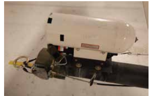
(CLOCKWISE FROM LEFT)

The A5 as equipped for spin-resistance testing with yarn tufts, spin parachute, and GoPro cameras used for data collection.